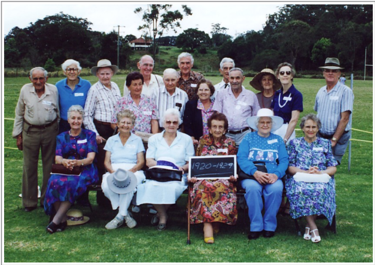
Reunion of past students 1920 - 1929