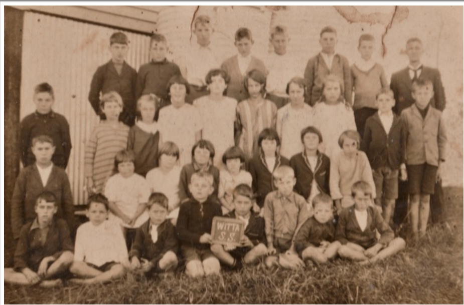
Wittia State School, 1928