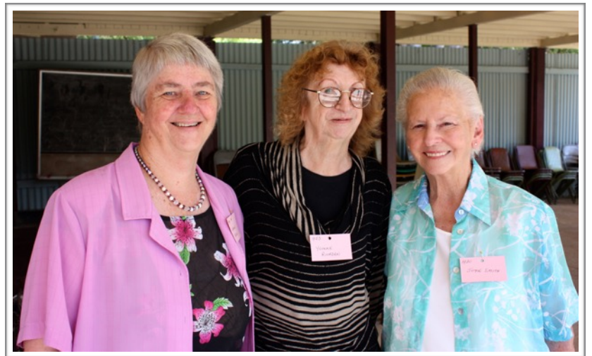
2012 Witta School Reunion to commemorate 120 years held at the Witta School