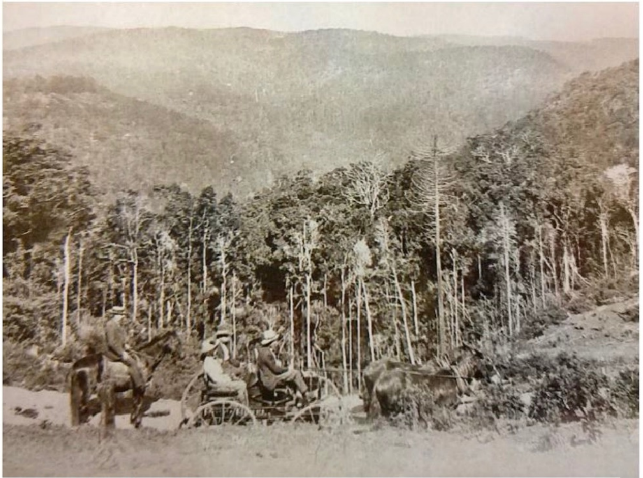
Figure 2: Blackall Ranges in the 1890s