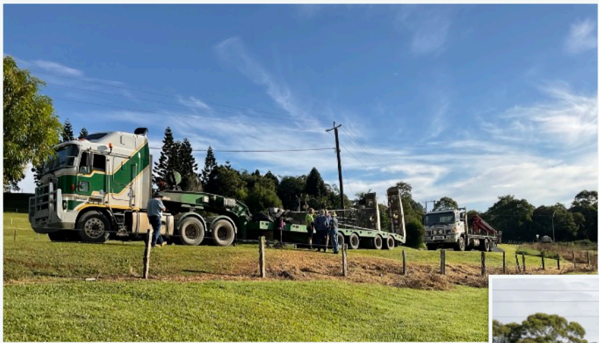
Arrival & unloading at Maleny Pioneer Village, May 2021