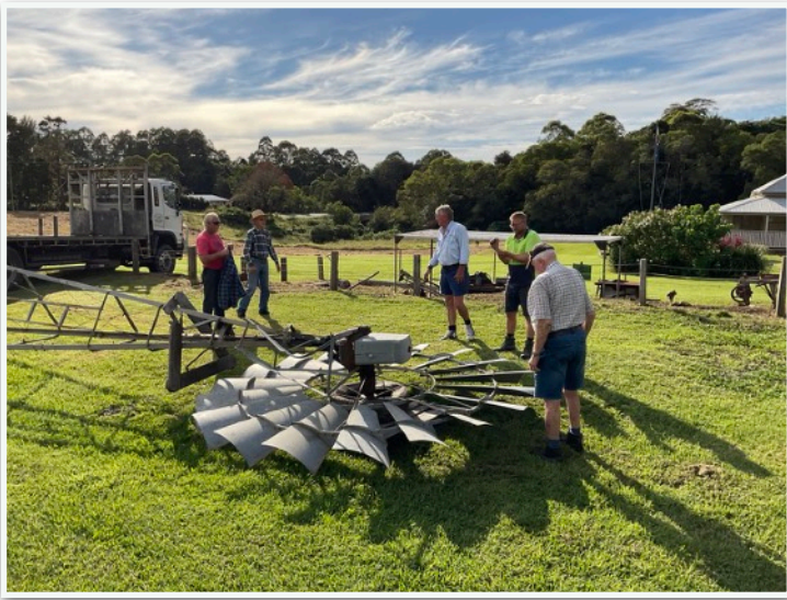
Unloaded at Maleny Pioneer Village