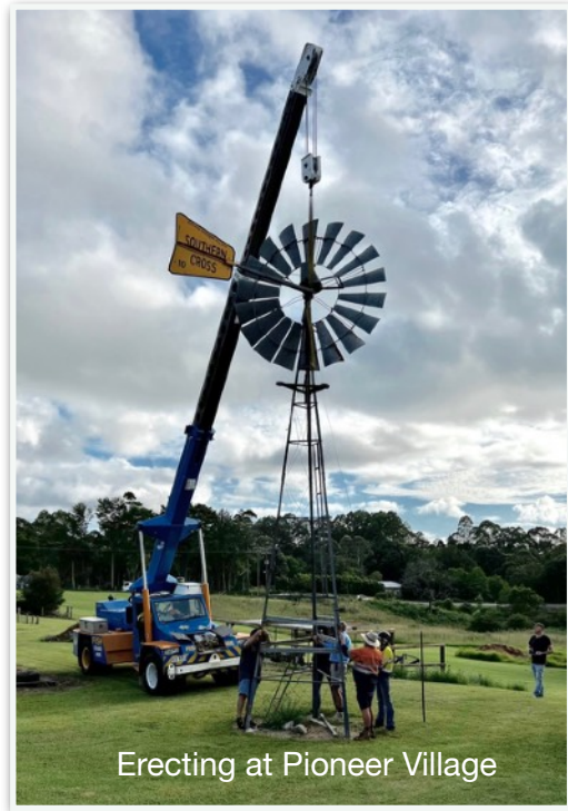
Erecting at Pioneer Village