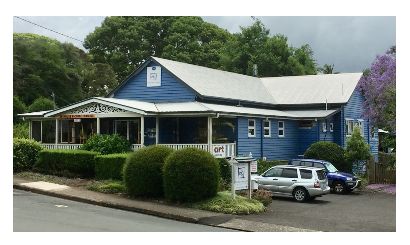
38b Coral Street, Maleny

At the time of research, the building operates as James Frames