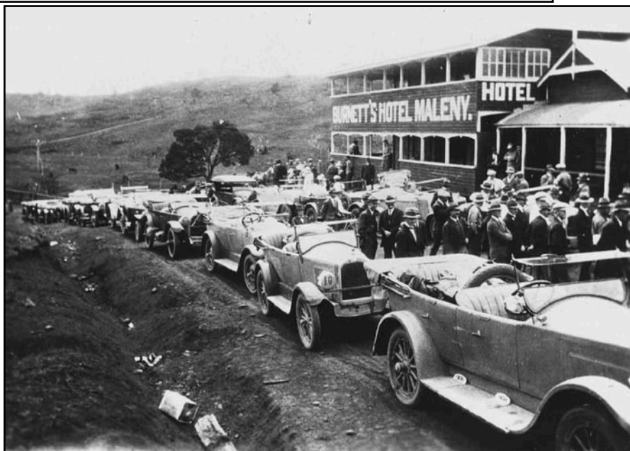
Model T Rally at Maleny Hotel 1924 A second storey, billiard saloon & barber shop were added by the Burnetts in the early 1920s