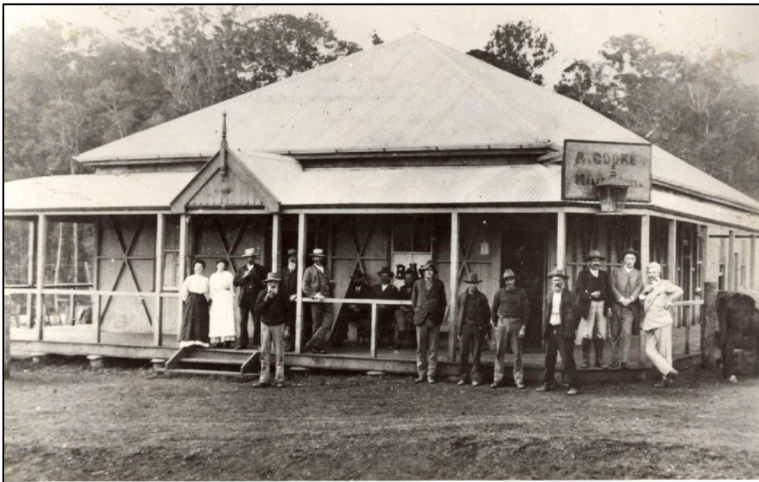
Maleny Hotel C1905