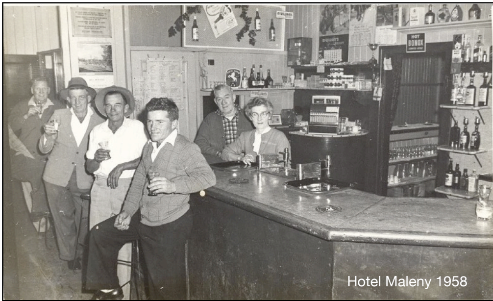
Hotel Maleny 1958