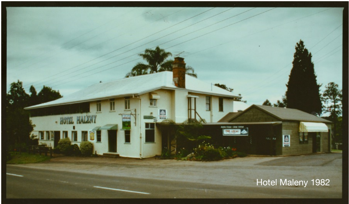
Hotel Maleny 1982