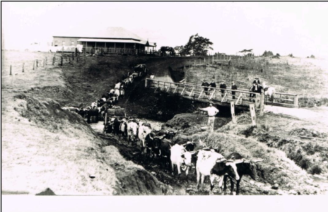
Teams crossing the Obi with the hotel in the background C1915