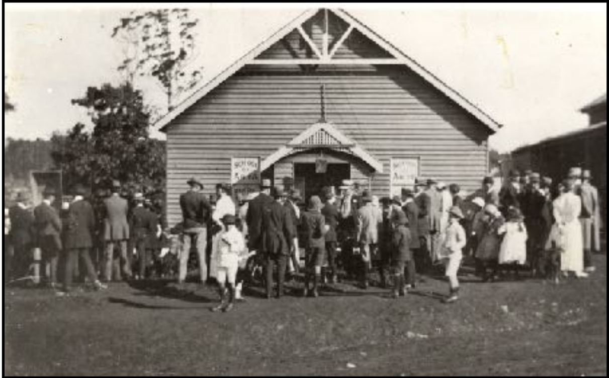
Opening of the Maleny School of Arts, 1910. This building burnt down in 1951, was rebuilt and opened in 1954