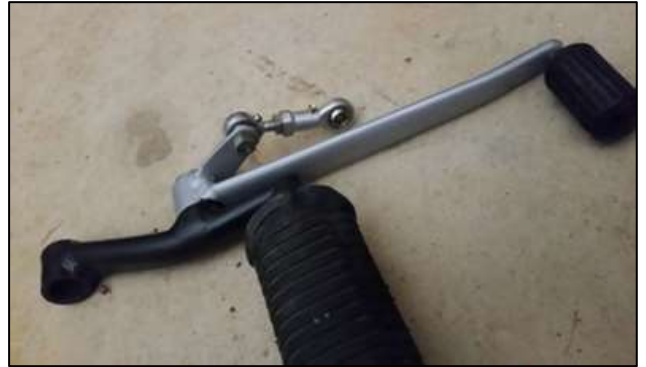
Spigot welded on and new lever in place