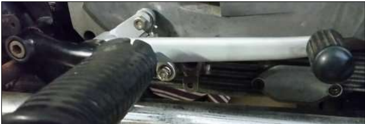
Assembled on "Pride and Joy"