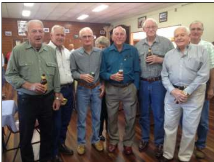
Show Society's Volunteer Lunch

http://www.qcwa.org.au/countrykitchens/meet-the-team/country-kitchens-blog/