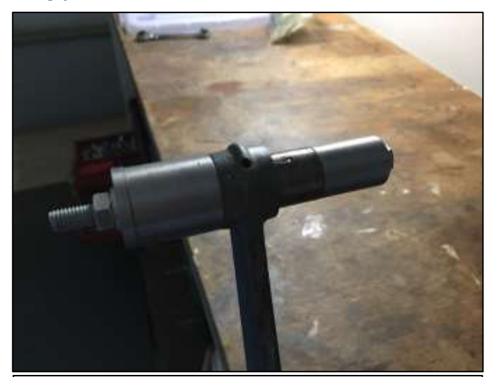
New tool installing the small end bush with a bolt. The tool can also push out the bush