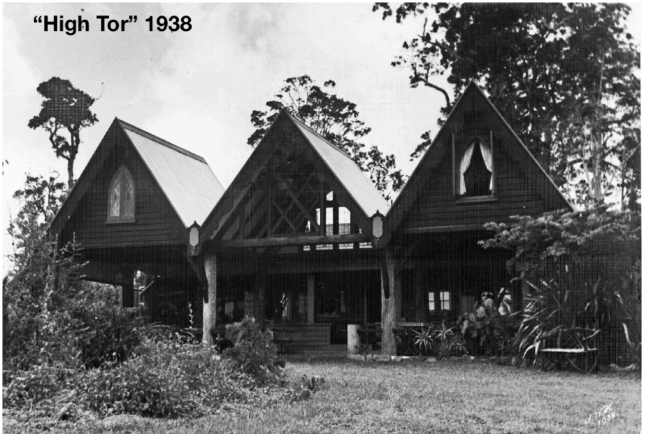
"High Tor" 1938